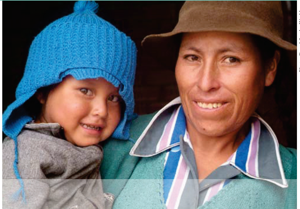
Bolivian mother and child

The evidence shows that abortion access does not reduce maternal mortality